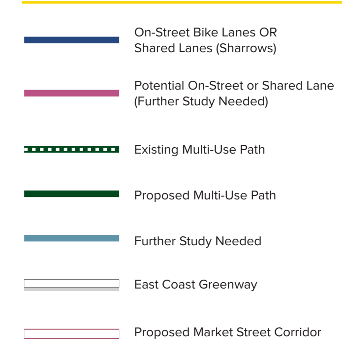
FIGURE 1. PROPOSED BIKE NETWORK